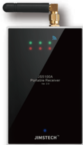
JS5100A Portable Receiving

Support 64 Intelligent temperature and power meter